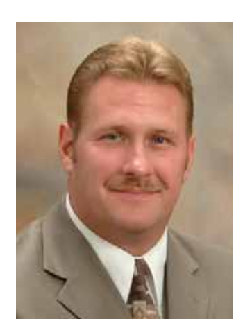
Mayor Tony Krasienko City of Lorain (Lorain County)