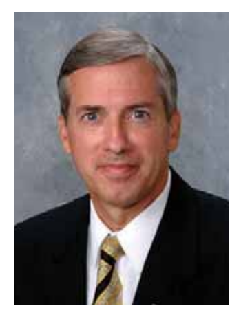
Mayor Thomas O'Grady North Olmsted (Cuyahoga County)